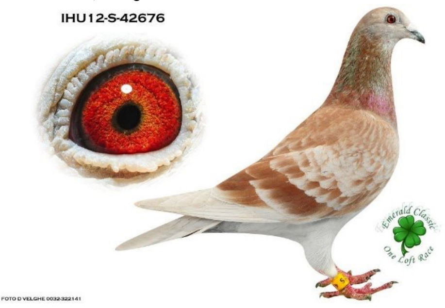
Mr Spice: top performer in the 2012 Emerald Classic O. L. R. and winner of 13th open in the Final Race.